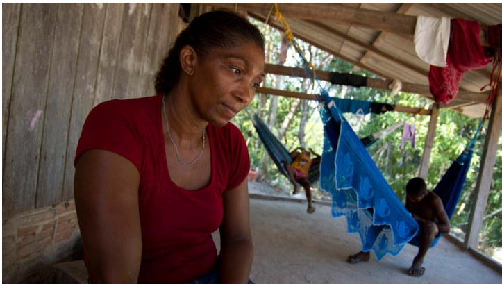
Christian Aid has been supporting marginalised communities to make the most of the Brazil nut harvest, deep in the Amazon.